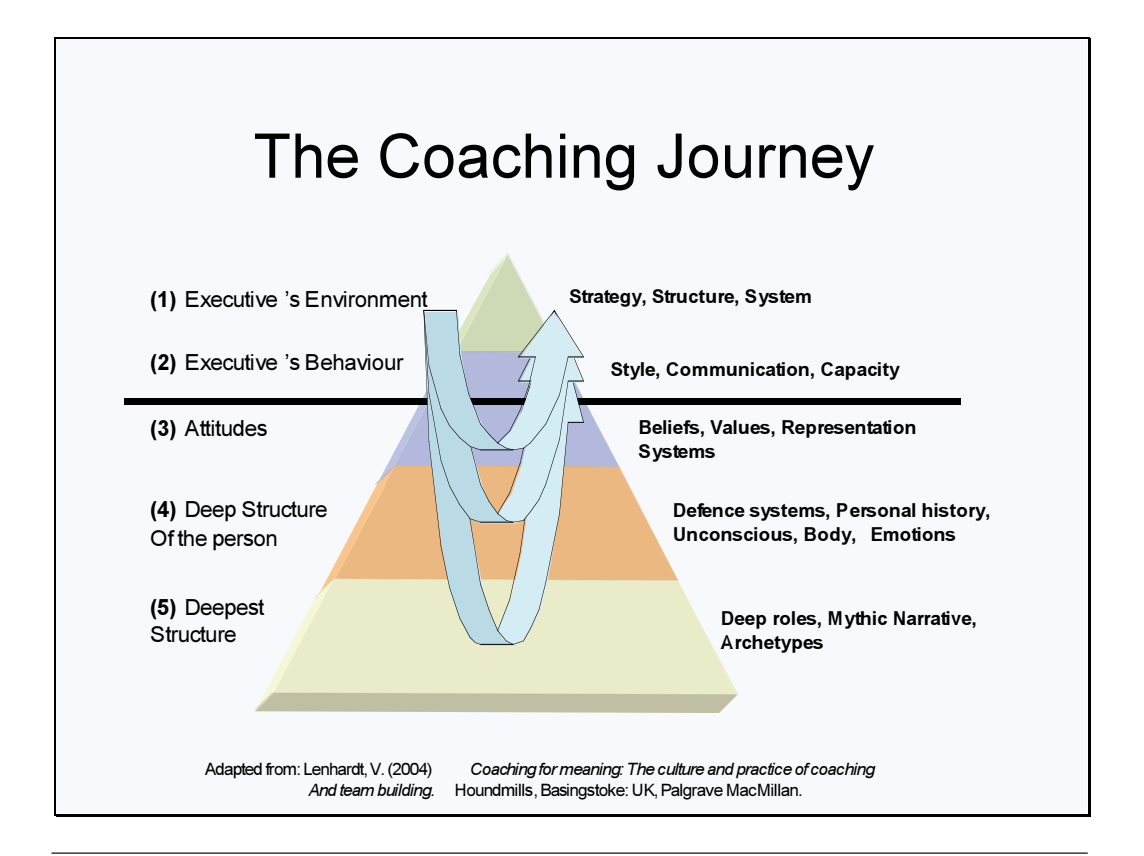
Figure 2: The 'U-process' in the coaching journey.

The coach conducts the coaching journey as a 'U-process', starting with the visible elements of the executive's domain of experience and then guiding the person into a progressively deeper exploration meaning. The process starts out as a series of 'shallow dives', each time coming back to the surface to 'draw breath'. Depending on the nature of the relationship between the coach and the executive, both may be prepared to spend longer periods of time at the deeper levels before returning to the 'visible world' with fresh insights and realisations (see Figure 2).